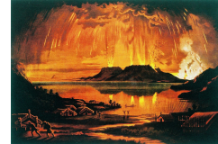
Tarawera Volcano erupting